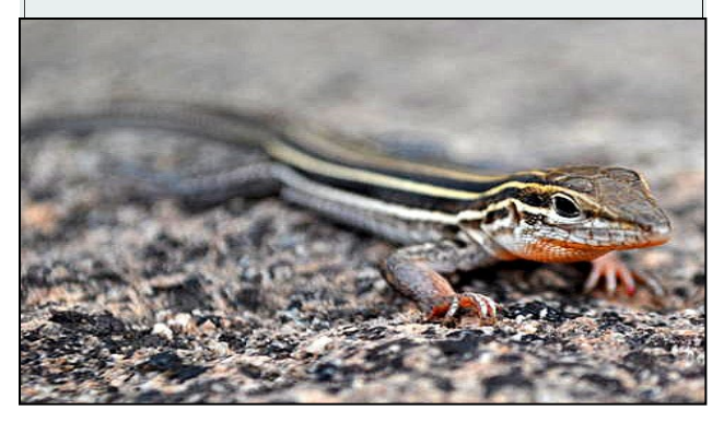
Orange throated whiptail lizard

Native Americans lived on our hill for countless centuries before European settlers arrived. We are custodians of the hill and surrounding canyons—a link between the Native Americans and Californians for generations to come.